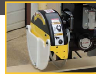
New Ty 8 guard