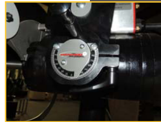
New Ty 8 bevel clamp handle