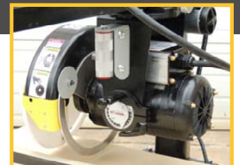
New Ty 8 carriage