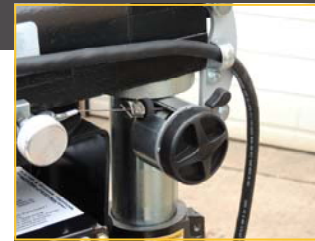
Carriage Return Spring